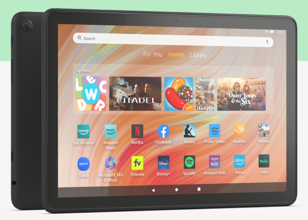
Figures apply to only Fire HD 10 Tablet 32GB 13th Gen, not including bundle accessories

Built to last. But when you're ready, you can trade-in or recycle your devices. Explore <u>Amazon Second Chance</u>.