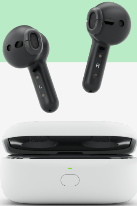
Figures apply to only Echo Buds - 1st Gen, not including bundle accessories

Built to last. But when you're ready, you can trade-in or recycle your devices. Explore Amazon Second Chance .